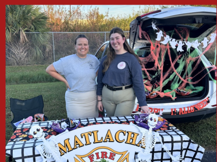
October 25, crews participated in Kiwanis Fall Festival.

October 26th, The District hosted our open house event. This year included our annual pumpkin patch, a live forcible entry demonstration, an educational fire safety trailer for kids, face painting, games, apparatus tours, hot dogs, ice cream, and much more! Lee Health's Blood Mobile was also on site taking donations.