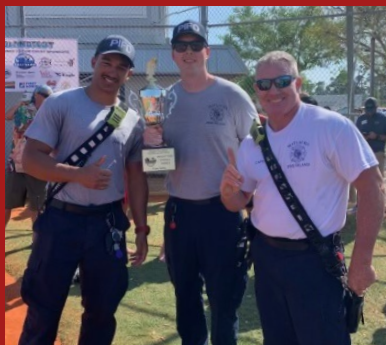
March 9th, crews were involved in a face off with LCSO at the Island Fest Mullet Toss.