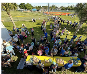
Thank you to our amazing crew and volunteers. This event would not have been possible without them!