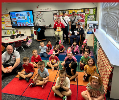
March 1st, crews participated in Read Across America at Pine Island Elementary.