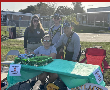
March 14th, the crew participated in Pine Island Elementary's Spring Fest.

Welcome to our first monthly newsletter of 2024! We're thrilled to kick off the year with a roundup of updates and achievements from March. This edition is packed with highlights of our department's accomplishments, community outreach efforts, training initiatives, and a glimpse into our call volume.