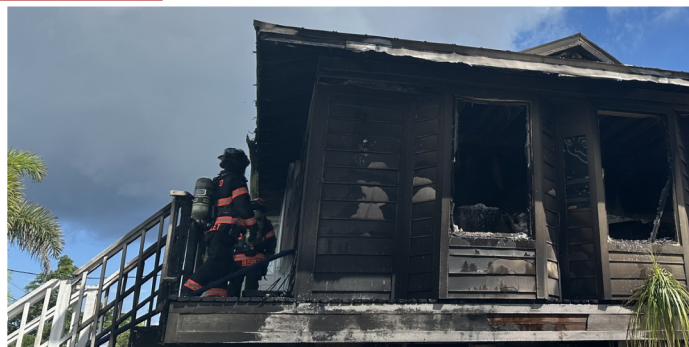
September 19th, crews responded to a two story residential structure fire in Bokeelia off Manheim Rd.