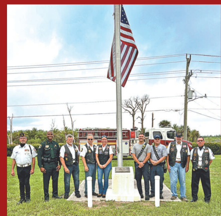
Crews attended the annual 9/11 Remembrance Ceremony hosted by American Legion Chapter 136.