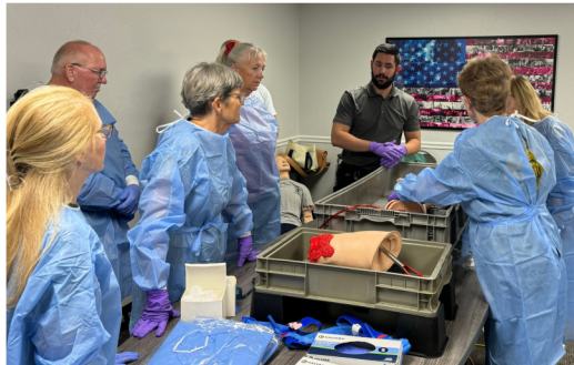
September 10th, our CERT team strengthened their skills with a lifesaving Stop the Bleed class!