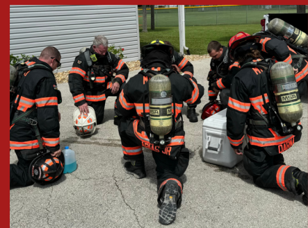
Many of our providers took part in a 9/11 stair climb that pays tribute the 110-story climb undertaken by FDNY firefighters at the World Trade Center.