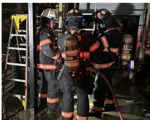
September 29th, crews responded to a large garage that caught fire and was partially extinguished by the homeowner.